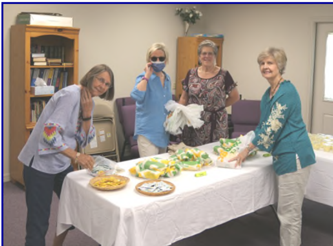
Some wonderful ladies of the Church provide lunch: